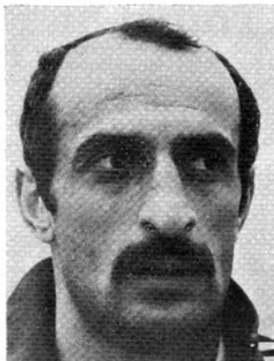
David Kipiani, Midfield-striker