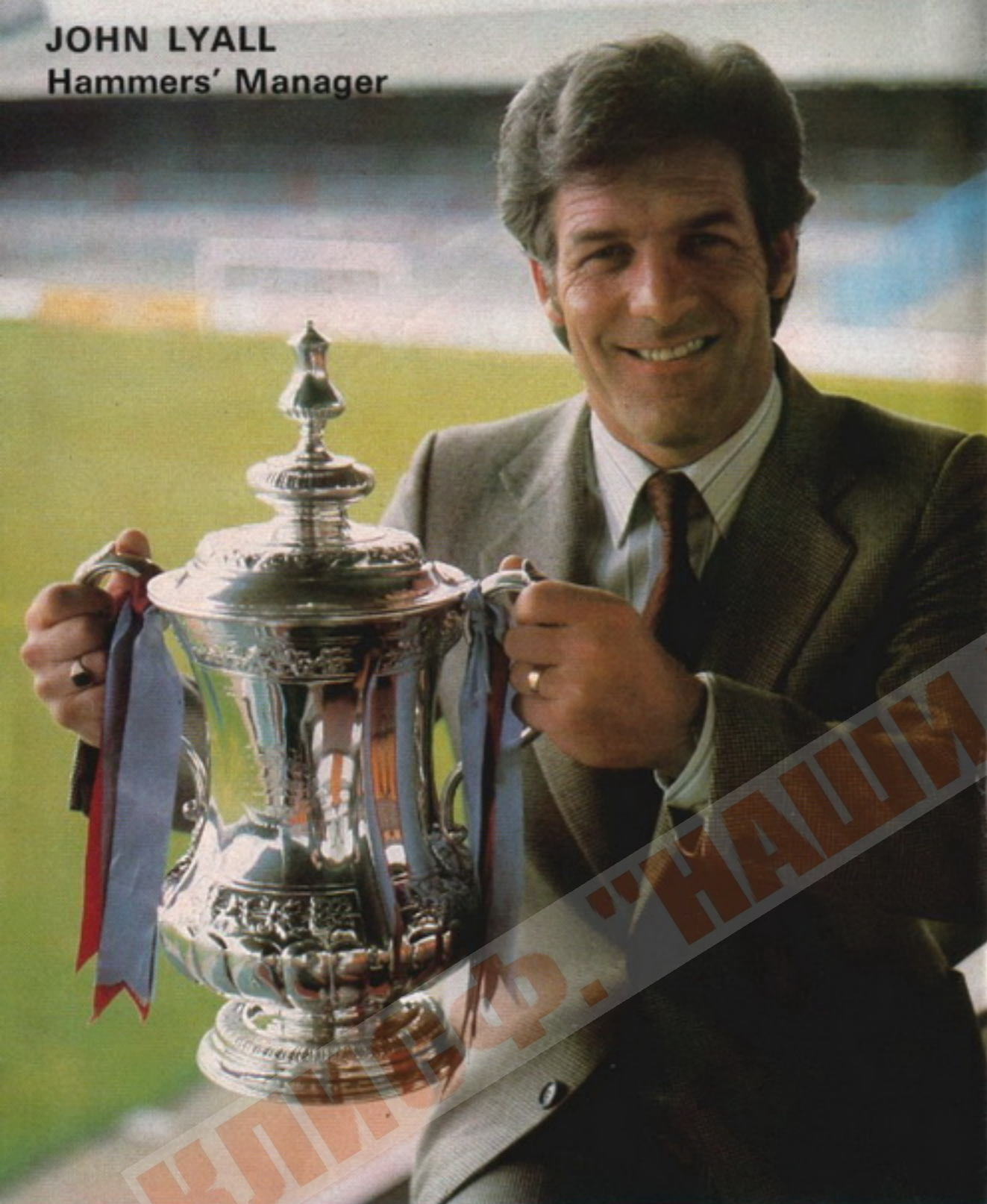
JOHN LYALL Hammers' Manager