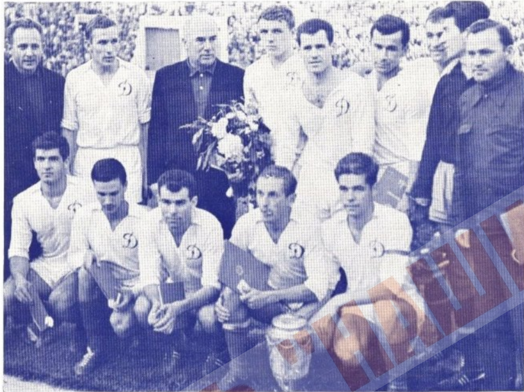
This is the Kiev Dinamo Cup-winning team, pictured after they had defeated Wings of The Soviet of Kubischev 1-0 in the Russian Cup Final last year