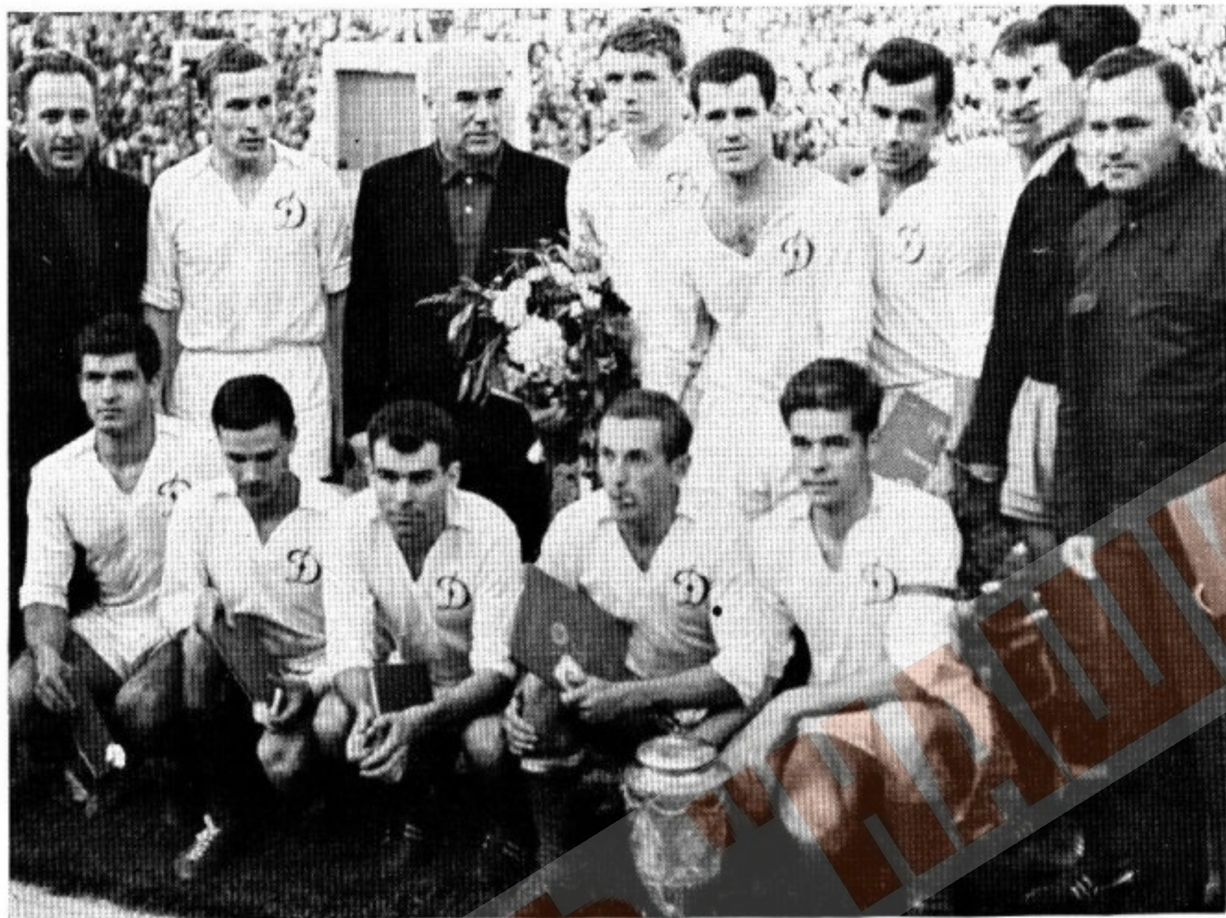
This is the Kiev Dinamo Cup-winning team, pictured after they had defeated Wings of The Soviet of Kuibishev 1-0 in the Russian Cup Final earlier this year