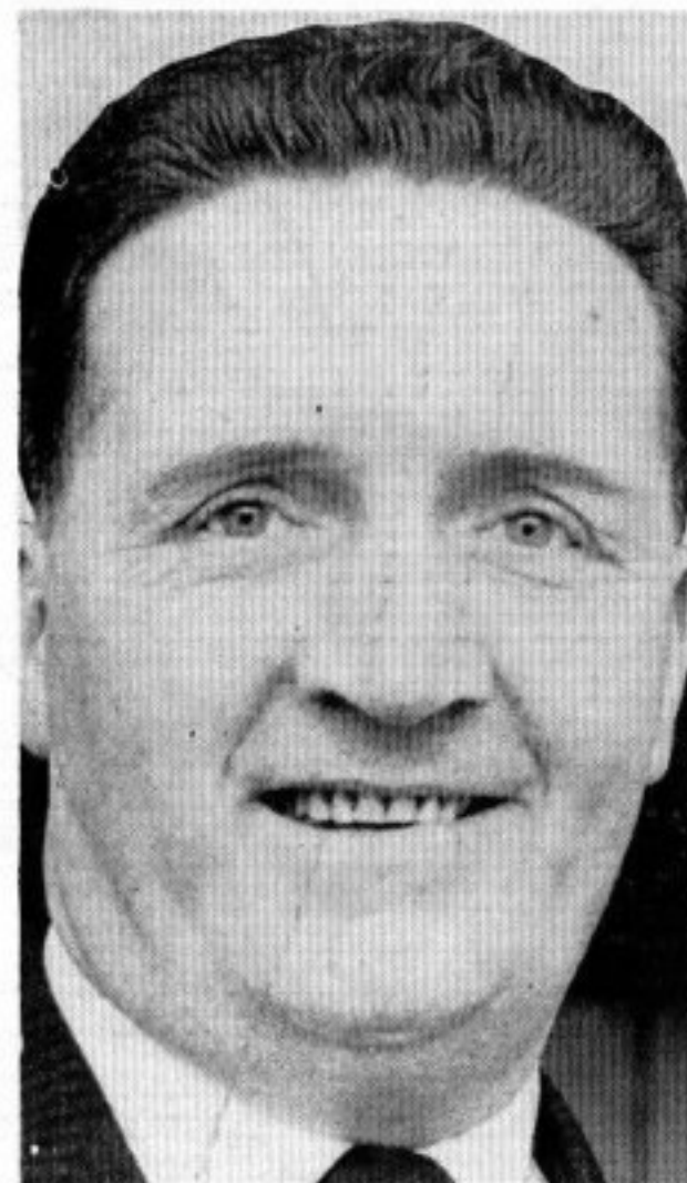
JOCK STEIN Celtic Manager

In flying to Tbilisi instead of going into a land of snow and ice we will be visiting Georgia which is next door to Turkey and Persia and is, at this time of the year, warm and sunny. Georgia, on the eastern end of the Black Sea, is the summer playground of the south of U.S.S.R. and is similar to the climate which our own holiday-makers meet when they go to the Costa Brava and Cote d'Azur.