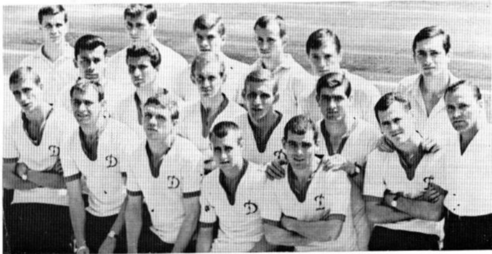
A party of Kiev Dinamo players at their home ground